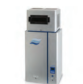
Condair US Ultrasonic in-room humidifier Very low energy cool mist humidifier with fan unit.