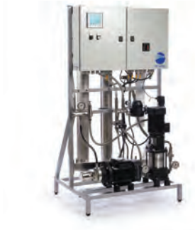
Condair HP High pressure in-duct humidifier Spray humidifier delivering humidification and evaporative cooling to multiple AHUs.