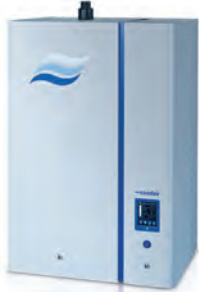
Condair EL Electrode boiler humidifier Reliable steam humidification that is easy to install, use and service.