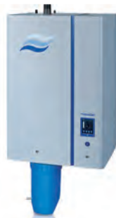
Condair RS Resistive humidifier Innovative scale management and no disposable boiling cylinders.