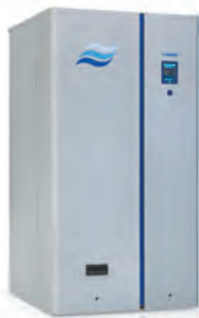
Condair GS Gas-fired humidifier Steam humidification with the operating economy of gas.