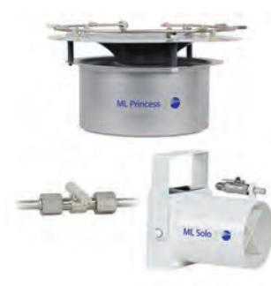
ML System High pressure in-room humidifier Water treatment and pressurisation plant with a selection of direct air nozzle systems.