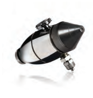
Condair JetSpray Compressed air and water spray humidifier Direct room spray humidifier with rapid evaporation and highly directional aerosols.