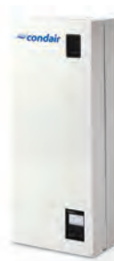
Condair CP3 Mini Low capacity electrode humidifier Up to 4kg/h of steam direct to a room or to an AHU.