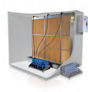
Condair ME Evaporative in-duct humidifier Provides low energy humidification and evaporative cooling.