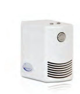
Draabe NanoFog High pressure in-room humidifier Discrete and quiet direct air humidifier, ideal for public places and offices.