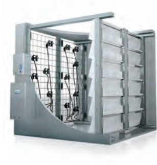
Condair DL Hybrid in-duct humidifier Close control, spray and evaporative humidifier.