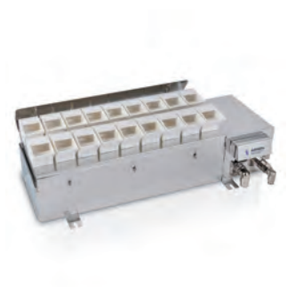
NKBD Series Ultrasonic in-duct humidifier Cool mist humidifier delivering up to 25kg/h from a single unit.